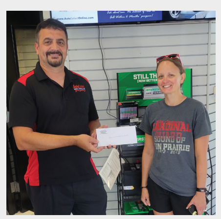
Auto Select Shawano is proud to support LEADS Primary Charter Schools We're Proud to Support our Local Communities! Look inside for money saving offers!