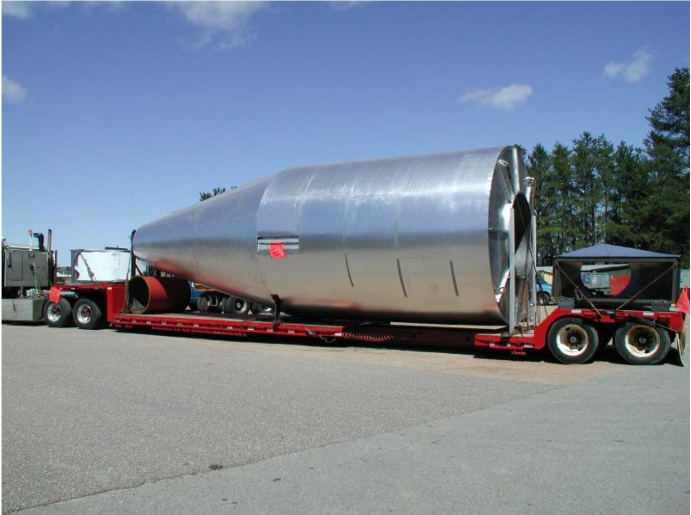
INSULATED CYCLONE DUST COLLECTOR